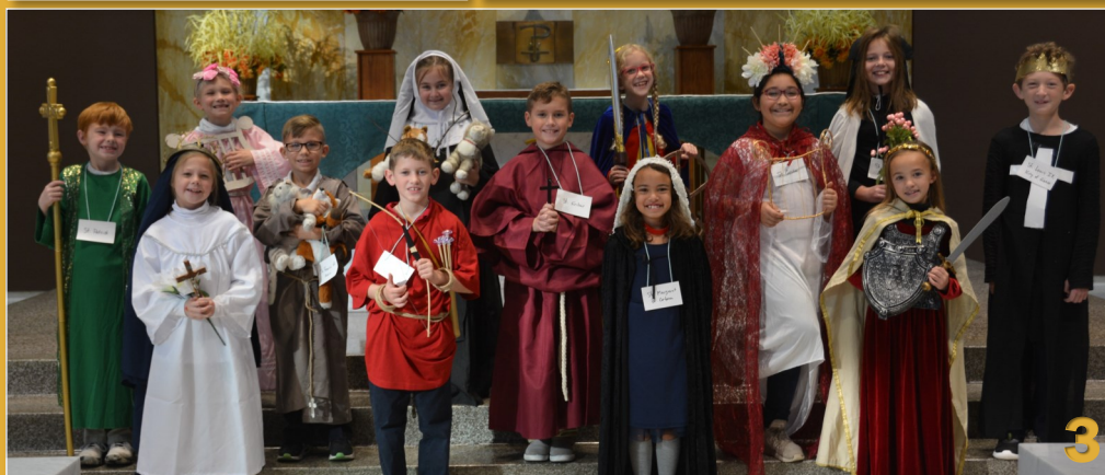
1: Students enjoy the use of new ViewSonic boards purchased with the proceeds of the School Auction 2: 5th grade Spanish class honored Hispanic Heritage Month by learning a traditional Mexican dance 3: 3rd grade brought the saints to life for All Saints Day by dressing like their Confirmation saints and presenting about them after an All School Mass