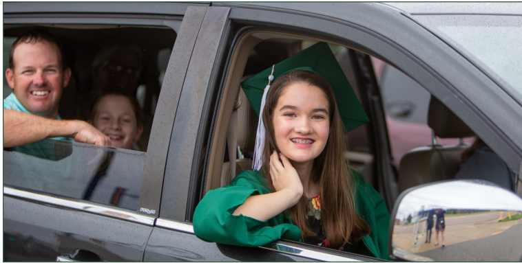
The Class of 2020 made SSPP history by adapting their Graduation Ceremony to a COVID-conscious drive-through ceremony in our parish parking lot.