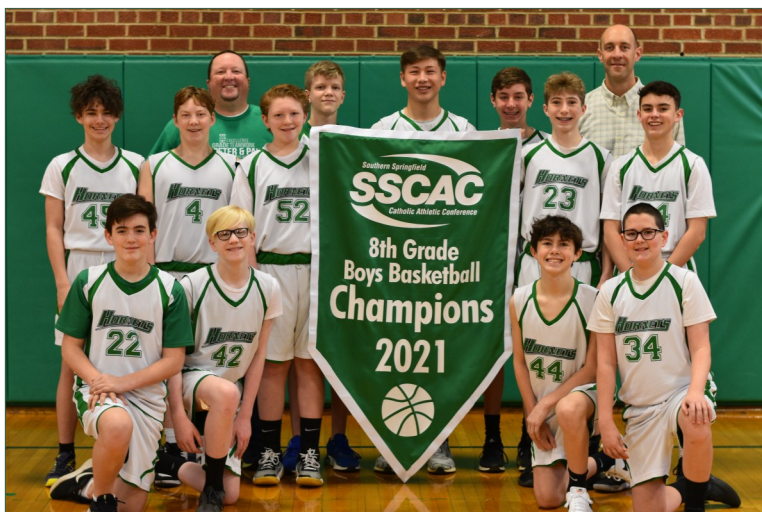
Our 7th/8th grade boys basketball team was named champions of the Southern Springfield Catholic Athletic Conference for 2021-22.